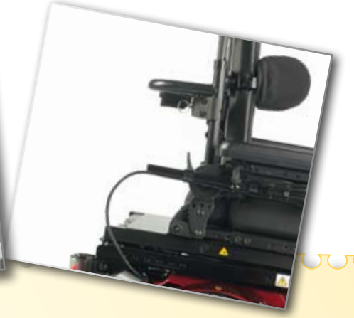
Optional swing-away laterals with comfort seat