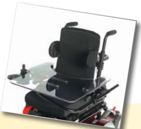
Swing-away and removable tray table

The standard Salsa/Salsa M seating system offers built-in growth potential for seat depth, width and height. It also features height and depth adjustment in the armrests and angle and depth adjustment in the footplates. The seat and backrest also offer angle adjustment for improved comfort.